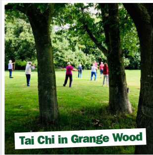
Tai Chi in Grange Wood

Heading outdoors into our open spaces, continues to be hugely popular. We are looking at how to increase community usage of the parks, working with partners on walking projects and exercise classes. A future focus on the outdoors will see us look at new ideas, such as gym equipment trails and other installations.